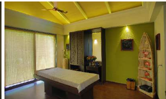
Spa & Massage Room